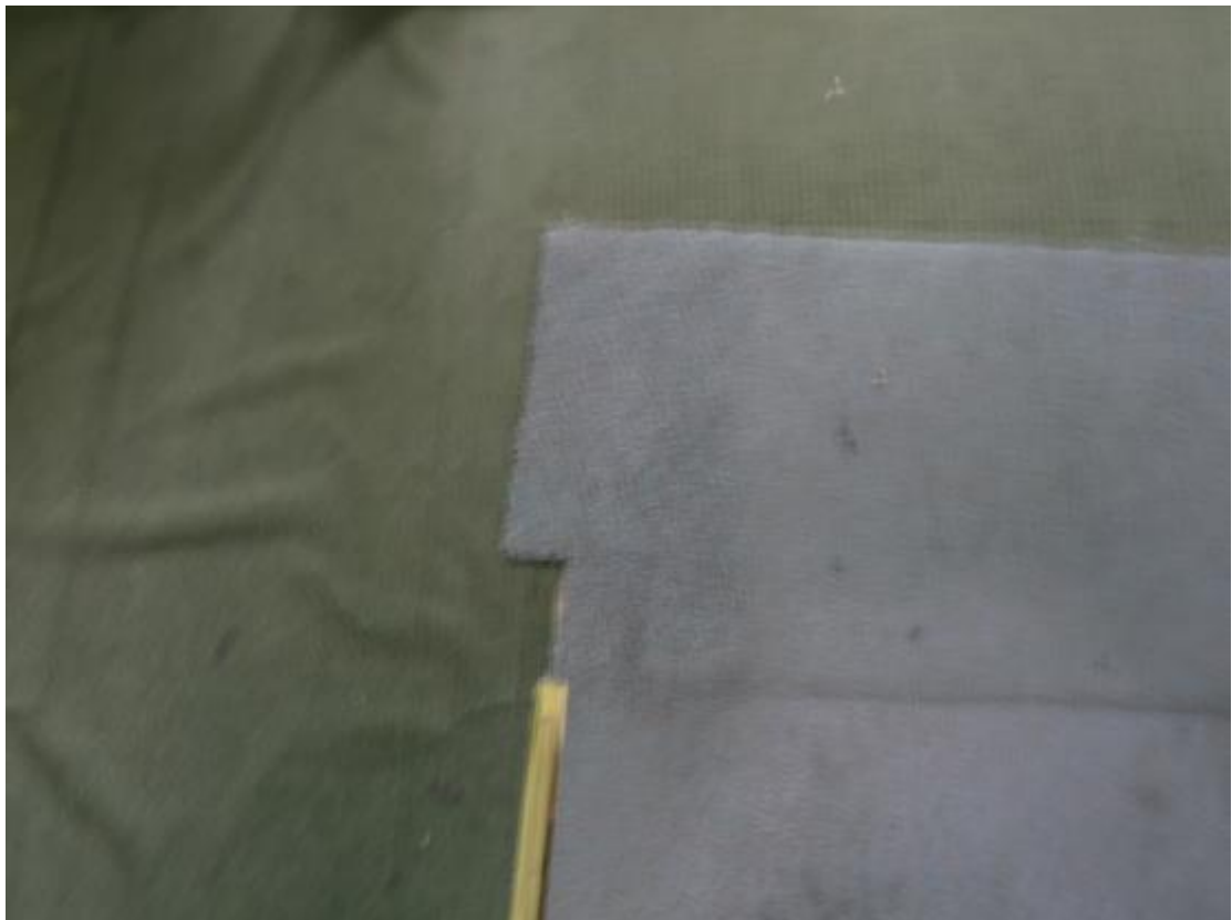
Stairs to the back room of 52 Easton Street