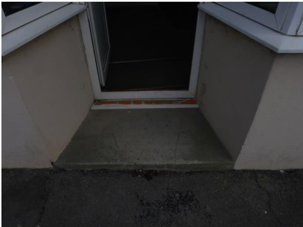
Door of 52 Easton Street from the inside