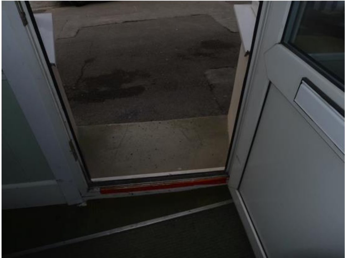
Carpeting in the front room of 52 Easton Street